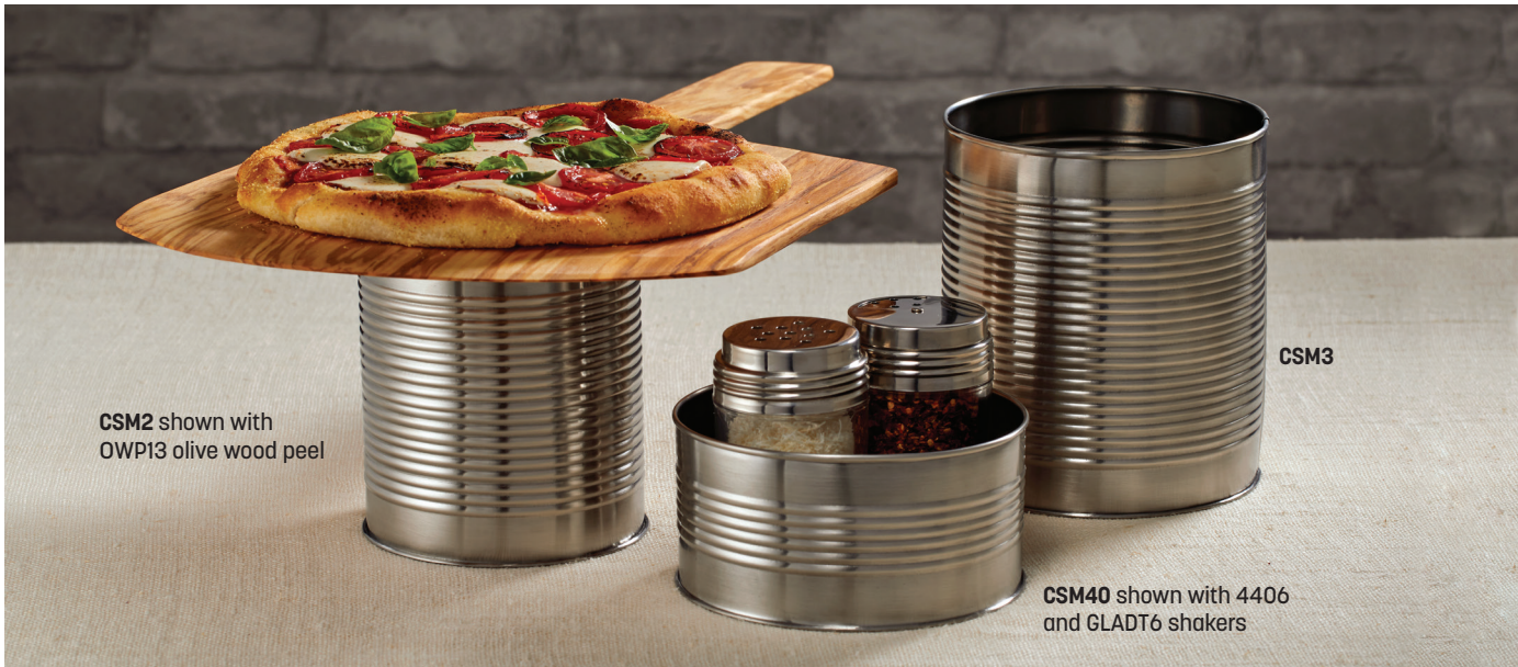
CSM2 shown with OWP13 olive wood peel